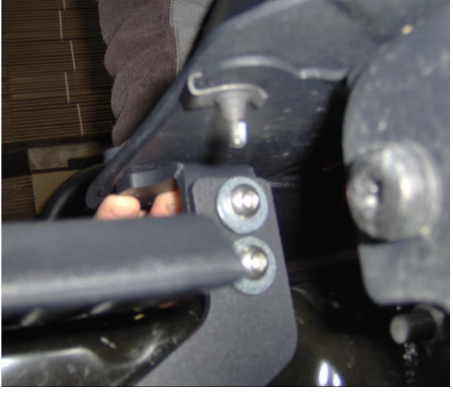
2295 N. Opdyke Rd, Suite E, Auburn Hills, MI 48326