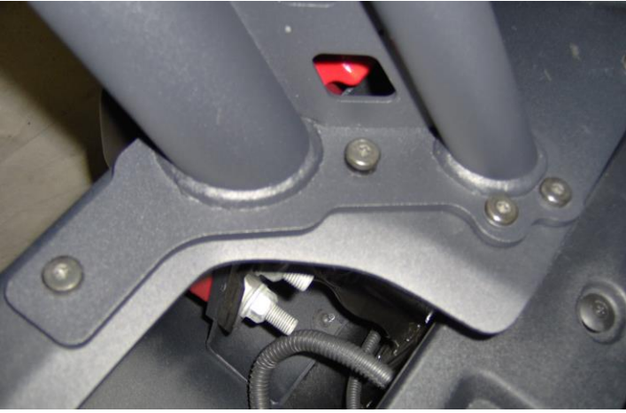
Alignments and make sure the bar/hoop is seated flat on the mounting surface. Now tighten the lower M8 hex bolts of the reinforcement brackets, 1 on each side.

Install the light brackets using the factory M6 bolts you removed in Step 2 and the 2 M6 nuts provided, 1 on each bracket (you do not need the nuts for non-winch install).