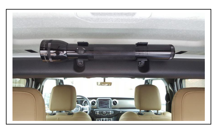
2295 N. Opdyke Rd, Suite E, Auburn Hills, MI 48326